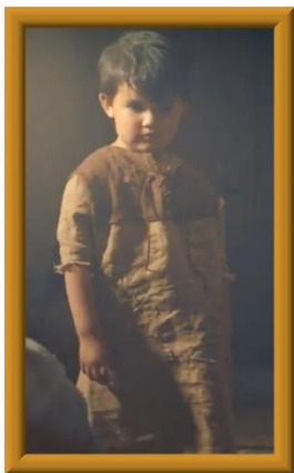
"The Wisemen Meet Jesus"

See your child's grades, missing assignments, and attendance anytime! The end of the 2 nd Quarter is on December 22 nd . Go to https://ca-net.powerschool.com for the PowerSchool login. Parents, please remember to use your PowerSchool login and password to connect your student(s) to your account with your parent access codes for each student. Parents may change their usernames/passwords. Under email notifications, you select how often you wish to receive email notifications and how detailed the grade and attendance reports will be. Contact hoffman@collegedaleacademy.com if you need assistance.