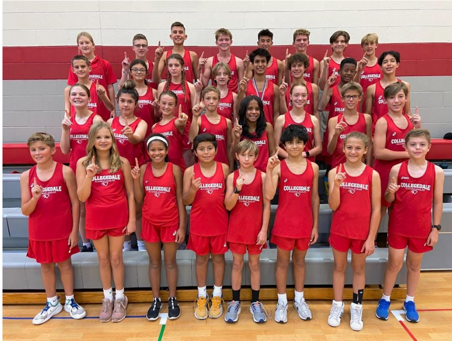
CA Middle Cross Country Team 2023